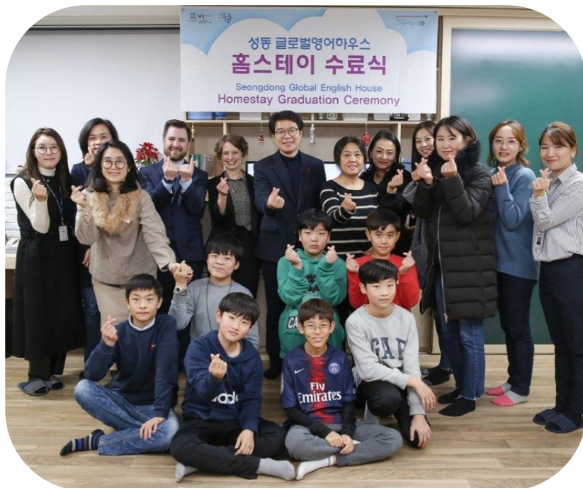
Homestay Completion Ceremony